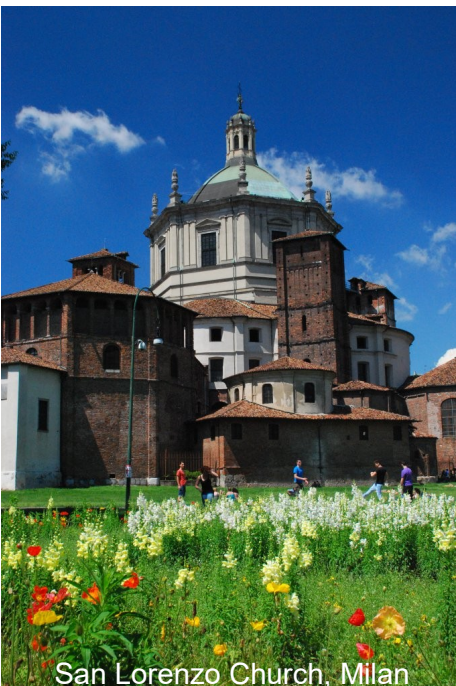
San Lorenzo Church, Milan