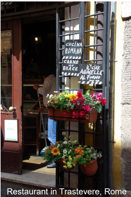
Restaurant in Trastevere, Rome