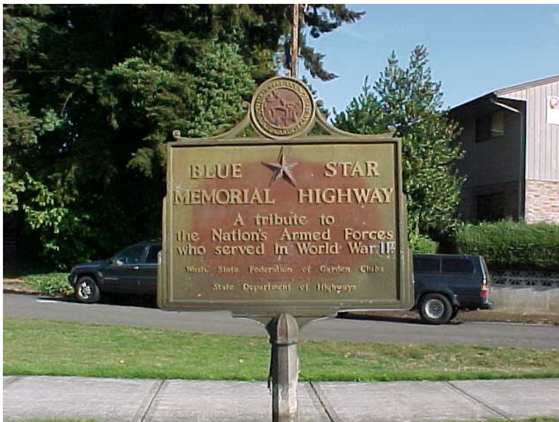
Blue Star Highway Marker, the oldest in Washington State