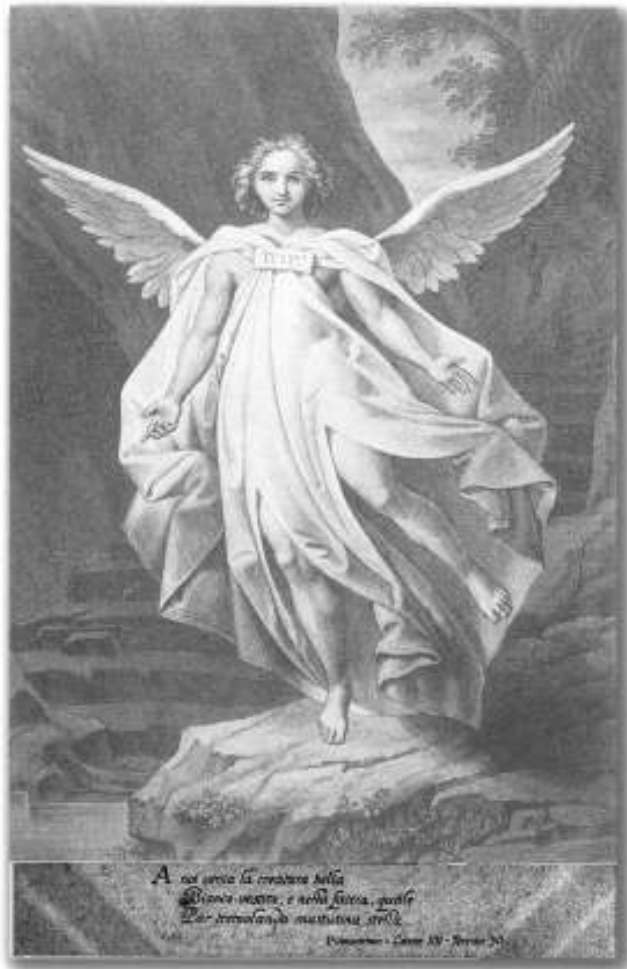
Edizione A. Bottoni e C - Roma