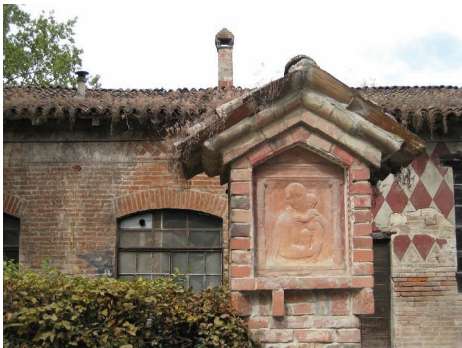
Grazzano Visconti